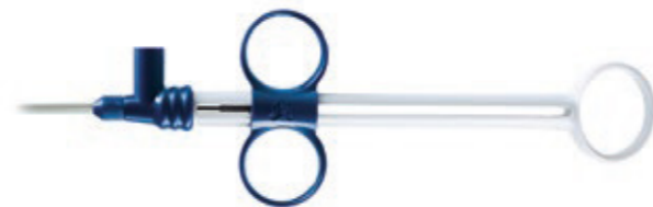
Precision grip with ergonomic design